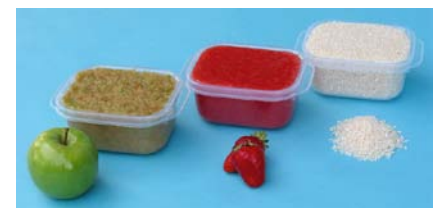
Applications limited only by your imagination

The patented compression plate makes short work of fibrous samples such as fibrated forage, grasses and sugar cane whilst a number of sample trimmers can prepare all types of materials for analysis. The conveyor belt is of unique design to