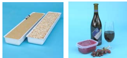
A versatile system for versatile applications

The unique and patented conveyor system of the InfraTester is designed to be adaptable for continuous direct carriage of sample material or compartmented operation with sample trays.