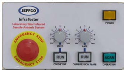
The simple but comprehensive Control Panel

The JEFFCO InfraTester Model IT02 includes a simple Control Panel to allow fast setup and easy operation even by non-technical personnel. But if you want to have computer control with automated sample tracking, scanning control and touch screen operation, then ask about the optional Touch Controller and JEFFCO InfraSpector Spectrometers .