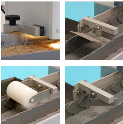
Sample Sensor and various Sample Trimmers

However, the InfraTester was designed to be used with almost all NIR reflectance spectrometers. Just seek our advice first to confirm compatibility.