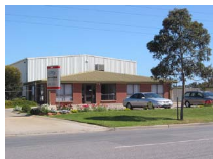
Our Australian Manufacturing Plant

Proudly designed and manufactured in Australia by: